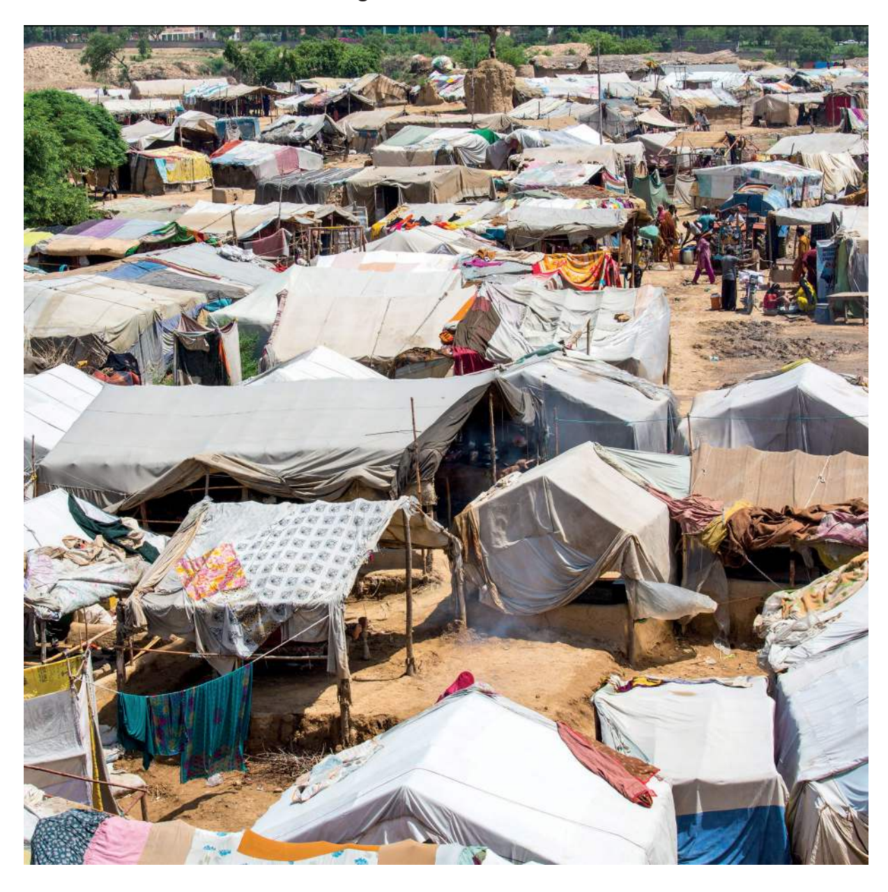
Fig. 5.2 for Question 5